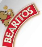
Photo credits: (l to r) all images © Thinkstock. Bear content and images provided by WWF.

DECOMPOSERS are the last part of the food chain. They help break down waste from the consumers. Mushrooms and other fungi use waste from the consumers to build their own energy.